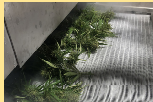
Cryogenic Flash Freezing