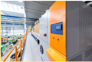
High Heat Rapid Drying