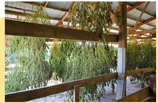
Traditional hang drying